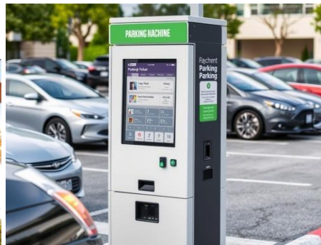
Parking Payment Systems